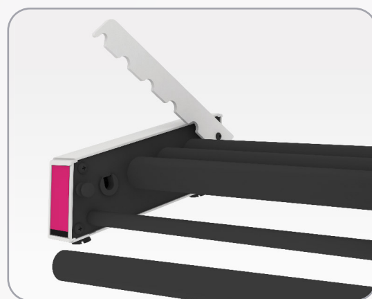
Tool-free removal and installation of rollers

Robust and space-saving design - robust construction for stable operation / small footprint requiring minimum of benchtop space